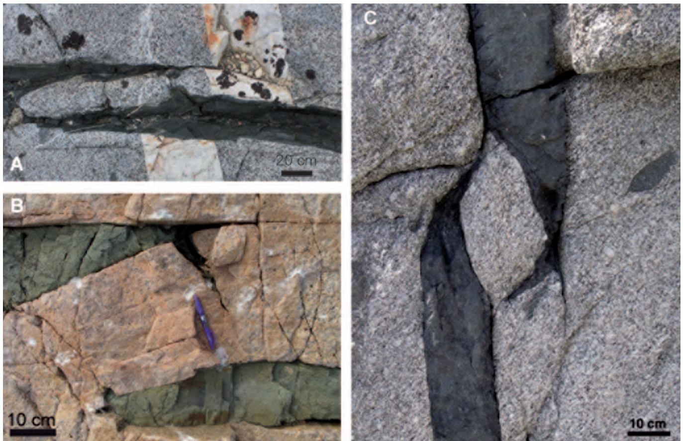
Fig. 1. – Examples of “en echelon” mafic dykes. A) Independence Dyke Swarm (California, USA). Notice the effects of superimposed ductile strain (foliations and shearing). B) Aiguablava dyke swarm (Costa Brava, Girona). C) SE Sardinia dyke swarm (Italy).

Fig. 1.- Ejemplos de diques máficos “en echelon”. A) Enjambre de diques Independence (California, EEUU). Nótese los efectos de la deformación dúctil sobreimpuesta (foliación y cizallas). B) Enjambre de diques de Aiguablava (Costa Brava, Girona). C) Enjambre de diques al SE de Cerdeña (Italia).