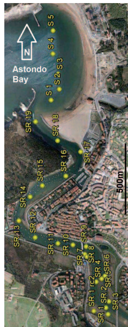
Fig. 2- Sampling stations and general locations. Key: SR- Station Ria; S-Station.

The mineralogy of the sediments from this estuary can be classified as siliciclastic, with a high content of calcareous bioclastic grains and organic matter. The quartz percentages are higher in the fine grain size (50-