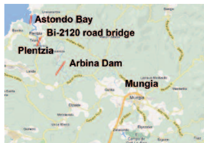
Fig. 1- Butron river water catchment area (Google Earth).

Human impact includes industrial and farming activities. Industrial activity is undertaken by small companies located within the inner zone of the Butron River catchment area; their sewage is treated at Mungia (Fig. 1), which was renewed and enhanced in 2010.