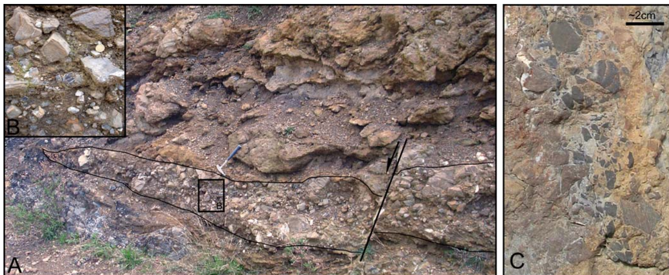
Fig. 2.- A) Representative breccia body within the Malaguide Complex with a sill geometry. It is cut by a high-angle normal fault. Note the lack of lateral continuity. Location: Star 3 of Fig. 1B. B) Detail of the polymict breccia with heterometric clast population. C) Small subvertical breccia body with angular and sub-rounded clasts. Location: Star 1 of figure 1B.

Fig. 2.- A) Cuerpo de brechas representativo dentro del Complejo Maláguide con geometría tipo sill. Se encuentra cortado por una falla normal de alto ángulo. Nótese la ausencia de continuidad lateral. Localización: Estrella 3 de la Fig. 1B. B) Detalle de la brecha polimictica con clastos heterométricos. C) Pequeño cuerpo de brechas subvertical con clastos angulares y sub-redondeados. Localización: Estrella 1 de la figura 1B.