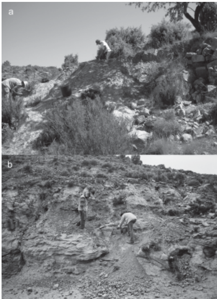
Fig. 1.- (a) El Carrillejo site (RD-11), (b) Puntal de Santa Cruz site (RD-13) in Riodeva (Teruel, Spain).

Fig. 1.- (a) Yacimiento El Carrillejo (RD-11), (b) yacimiento Puntal de Santa Cruz (RD-13) en Riodeva (Teruel, España).